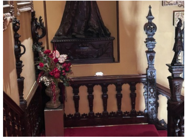
Those mice get everywhere!