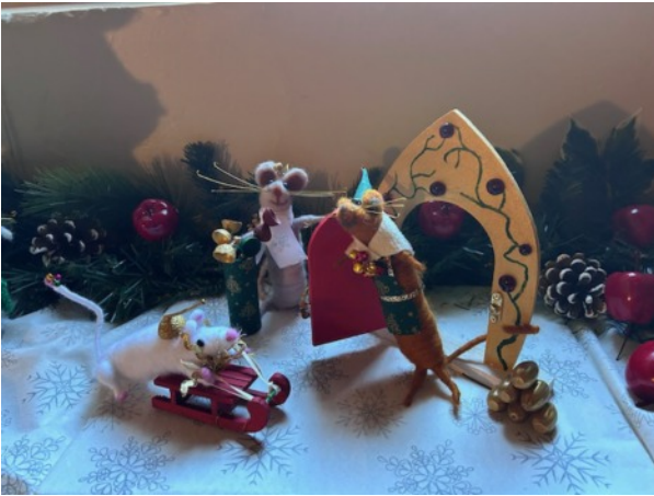
A mouse Christmas