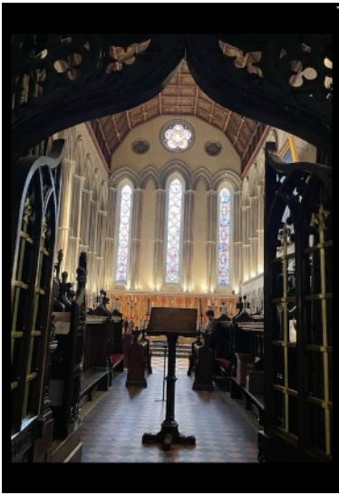
Interior of Jesus College Chapel