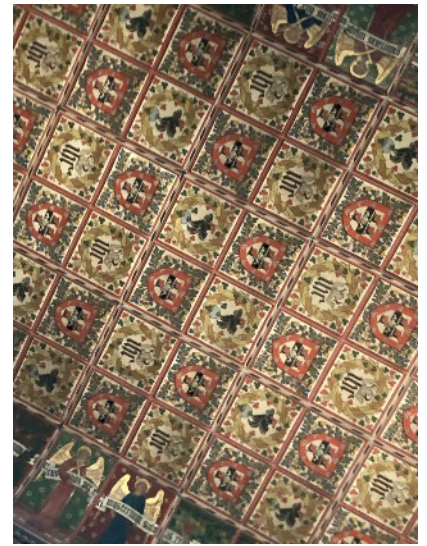
Ornate tiling on the floor of part of the Chapel