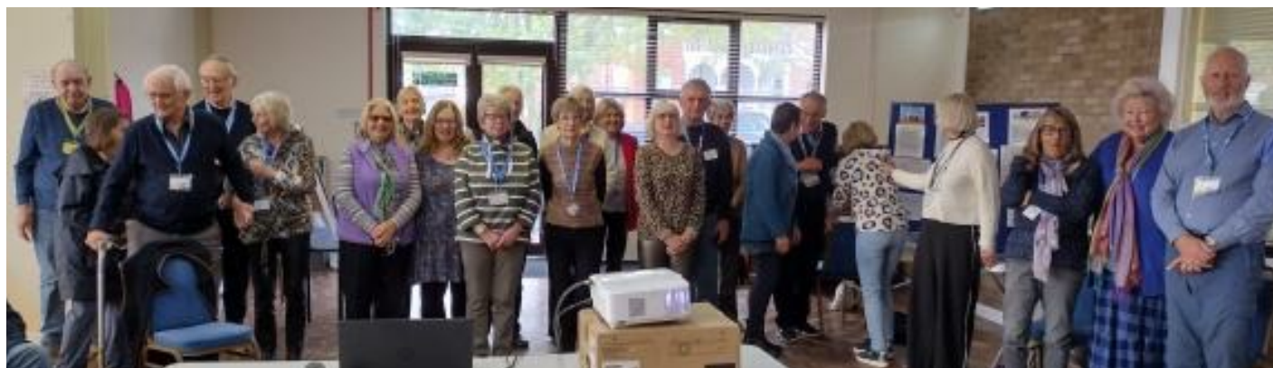
Many of our Group leaders, snapped at the AGM in October

Current roles: Leader of Play Reading 2 and Rock Music Appreciation groups, Newsletter Sub-editor)